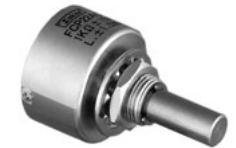
Model FCP22AC (Metal Housing)